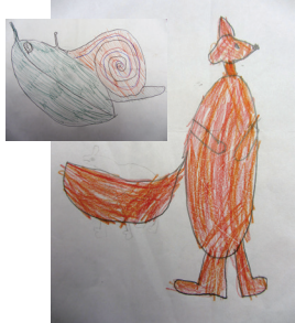
THE FOX & THE SNAIL